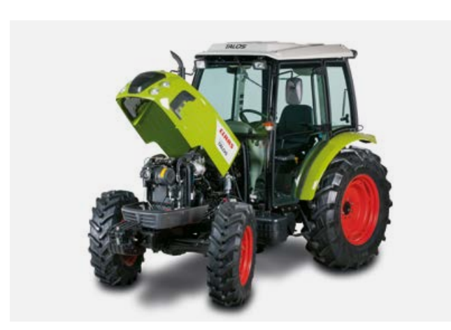
The one-piece bonnet provides quick and convenient access to all servicing and maintenance points. Easy access to the engine air filter and radiator means that they can be cleaned quickly whenever necessary.