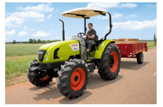
Thanks to the optimised transmission increments, the TALOS 100 reaches its top speed of 30 km/h very quickly. Its ideal weight distribution ensures stability and driving comfort even on longer journeys.