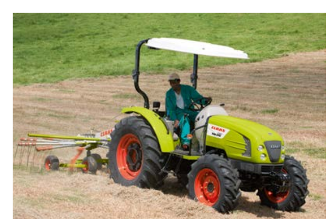
TALOS. Outstanding reliability.

Designed and built for hard work, the TALOS offers enormous versatility in a compact format. It can be used all year round, from tillage to harvest, and is suitable for any site – or any driver. Its simple operating concept makes it easy for any driver to master the day's challenges without needing lengthy prior instruction.