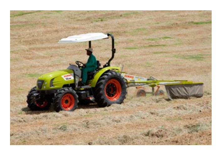
The TALOS 100 can power any implement thanks to the standard-fit 540/540 ECO/1,000 PTO.