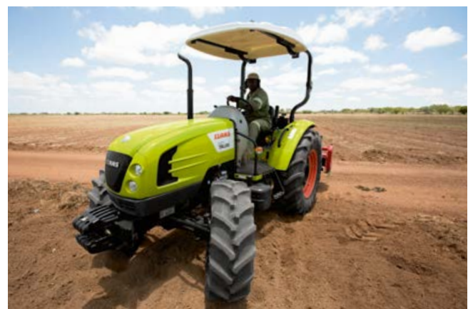
Compact and nimble, the TALOS 100 proves its true strength on headlands and in confined spaces. The hydraulic output of 36 I/min for the rear linkage and two spool valves enables swift turning manoeuvres. The working position is stored via the intelligent mechanical rear linkage control system and can be called up at the push of a button.